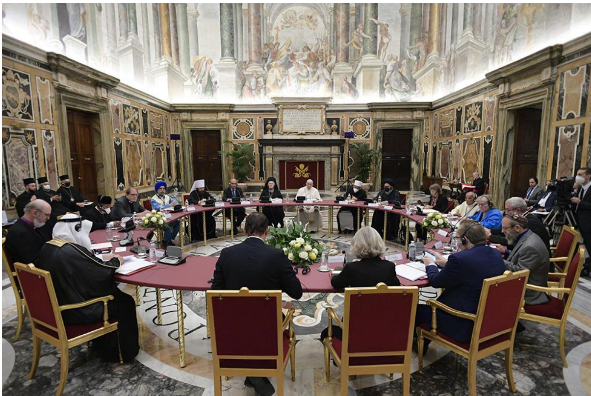
Pope Francis and other religious and lay leaders attend the meeting, "Religions and Education: Toward a Global Compact on Education," at the Vatican Oct. 5, 2021.

Dear brothers and sisters, I thank you for taking part in this meeting. I also thank those who, due to the pandemic, could not be here today. And now I invite you to a brief moment of silence, asking God to enlighten our minds so that our dialogue will bear fruit and help us courageously to pursue the paths of new educational horizons.